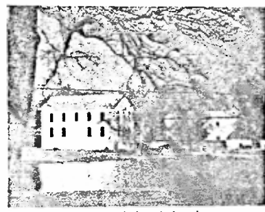
7. PHOTOGRAPH N. Netherton, 1972